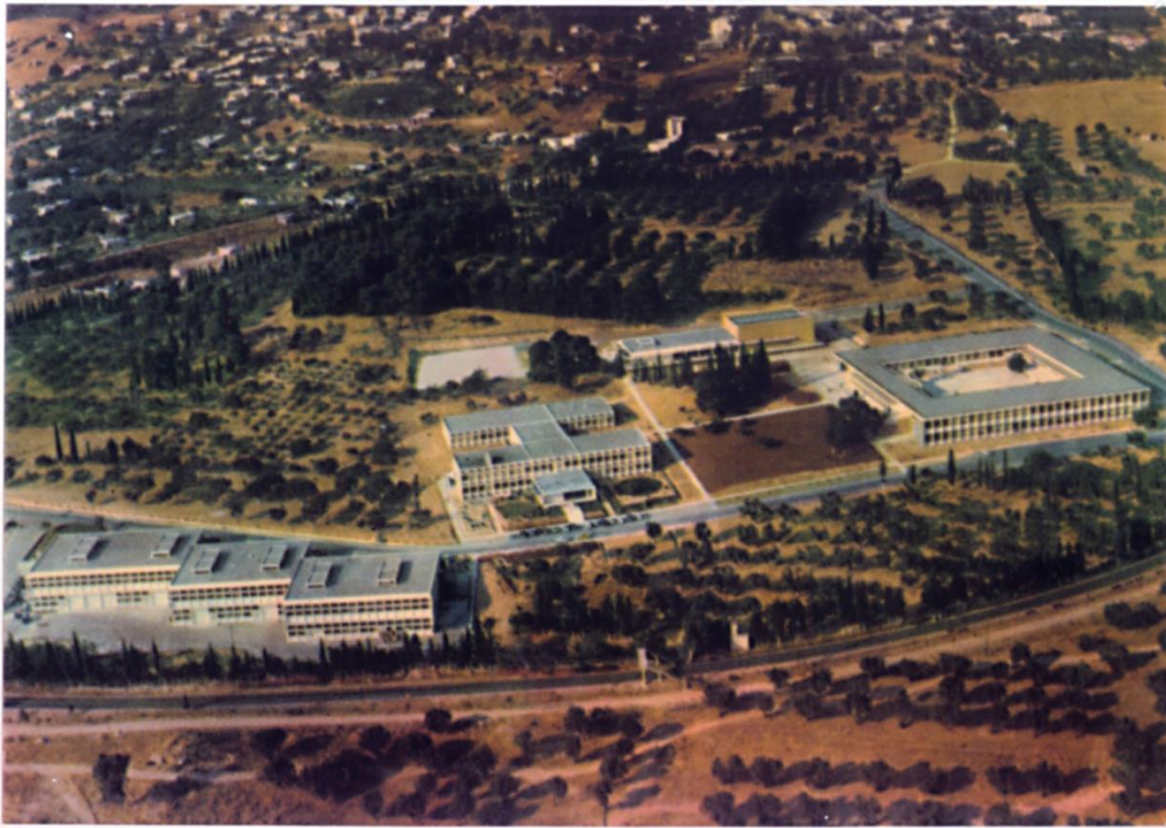
Aerial Photography of SELETE

SELETE continued to function with this structure until the end of the academic year 2001-2002, when it was nullified in favour of the establishment of an upgraded new School, officially named School of Pedagogical & Technological Education (ASPETE) .